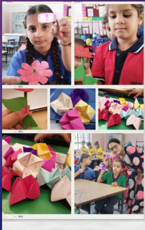
MAKING OF TIPPY TIPPY TAP