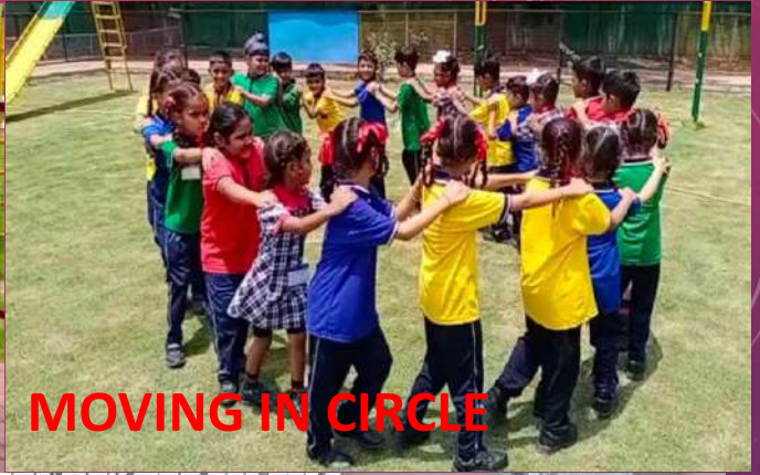
MOVING IN CIRCLE