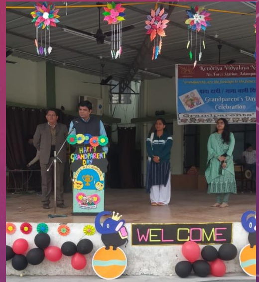
Adressing by Principal Sir