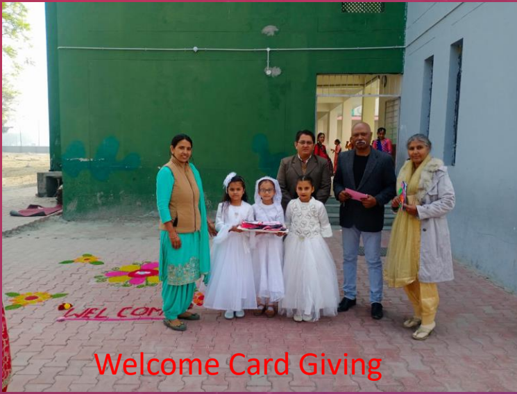
Welcome Card Giving